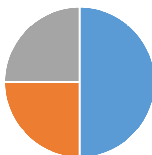
LPP Candidate Pool

In Year III: 76 Candidates completed 34 different Masters Degrees, and 3 different PhDs; 35 Candidates have practiced abroad on average 7.3 years.