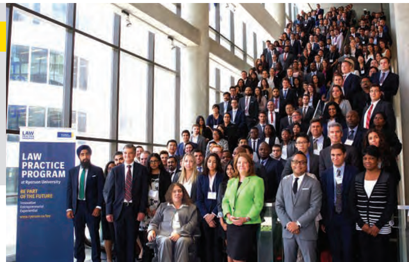
2016/2017 LPP Candidates

Looking forward to the 2017–2018 Law Practice Program