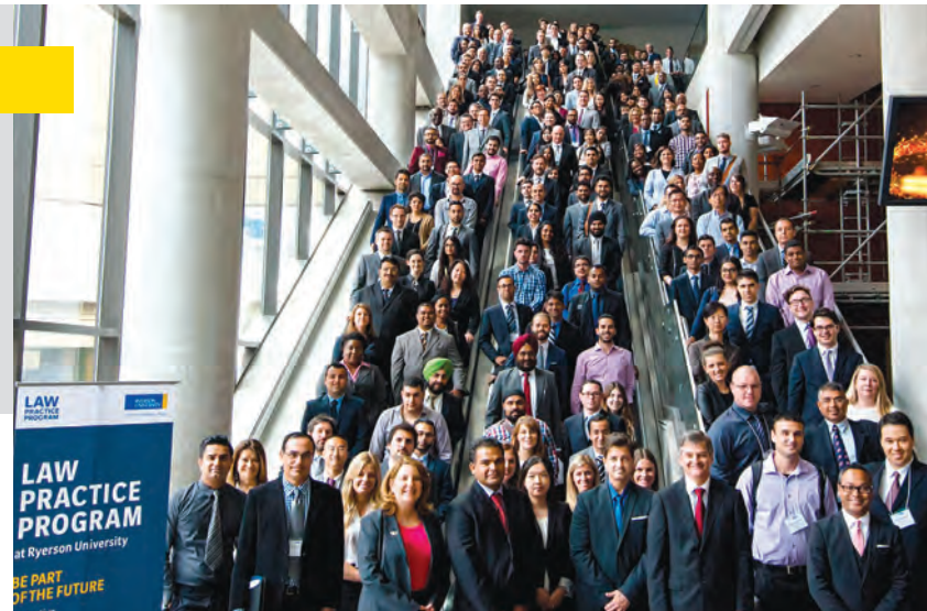
2015/2016 LPP Candidates

Looking forward to the 2016–2017 Law Practice Program